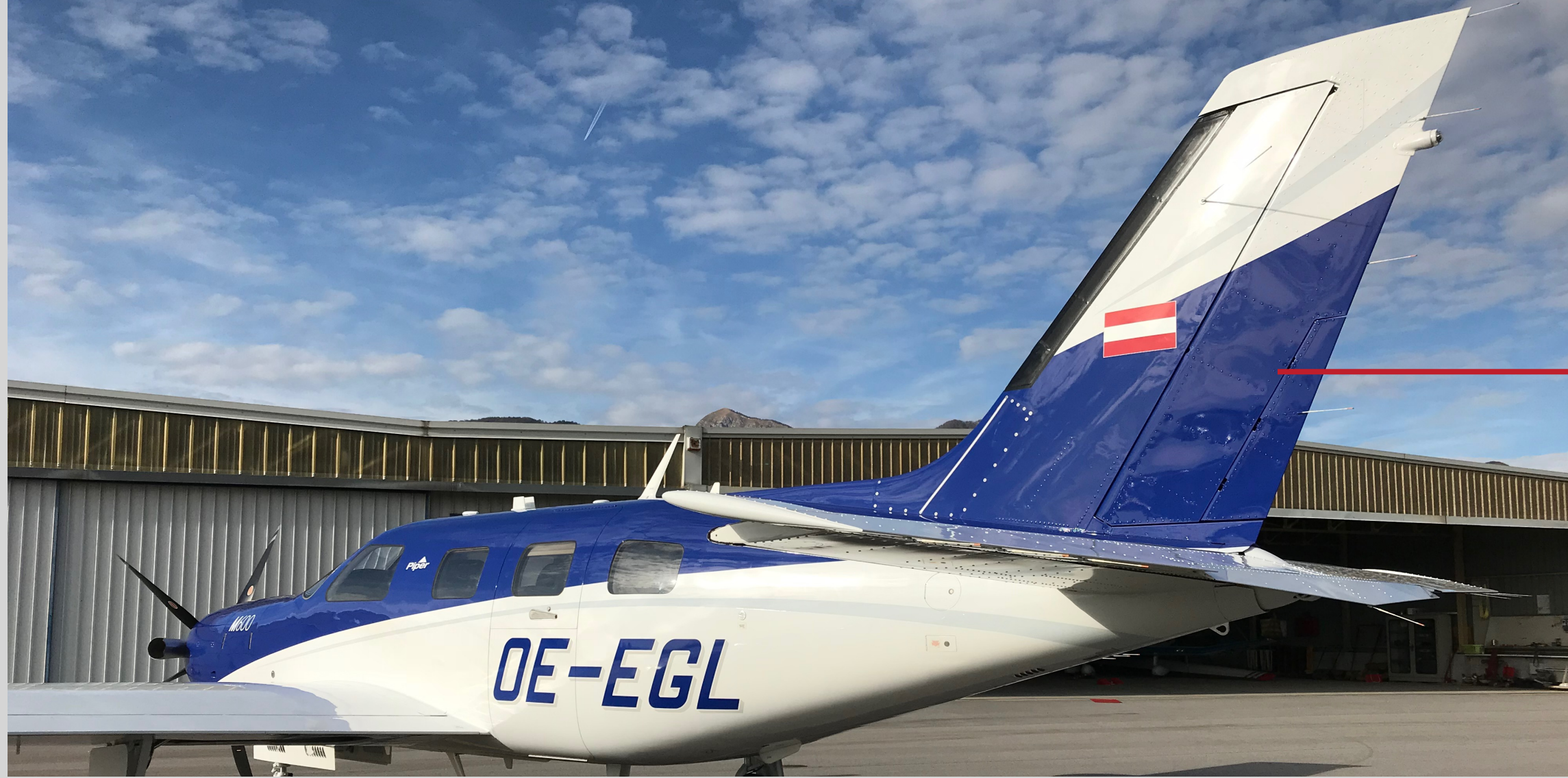
Majestic White and Blue Base Paint